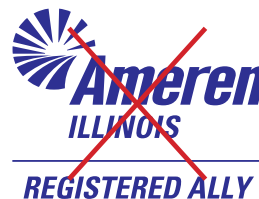
IMPROPER FORMATTING OF THE GRAPHIC