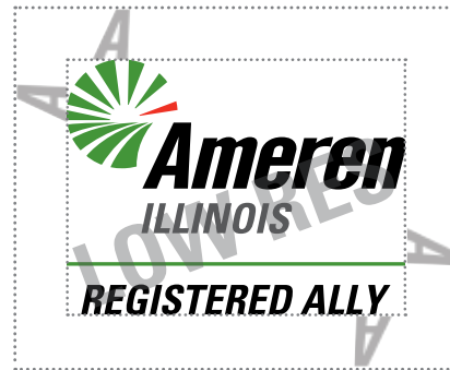
PROPER SPACING FOR APPROVED GRAPHIC

ADJUSTMENTS: Do not redraw, alter, stretch, tilt, rotate or distort the approved graphic. You may also not use other colors in place of those in the approved artwork files.